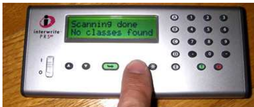
Figure 3: Interwrite Step 2