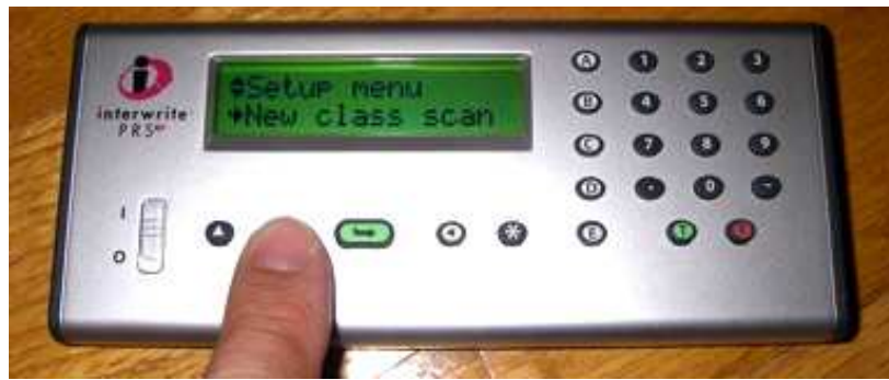
Figure 4: Interwrite Step 3