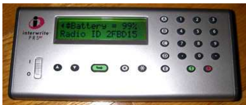
Figure 6: Interwrite Step 5