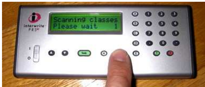
Figure 2: Interwrite Step 1