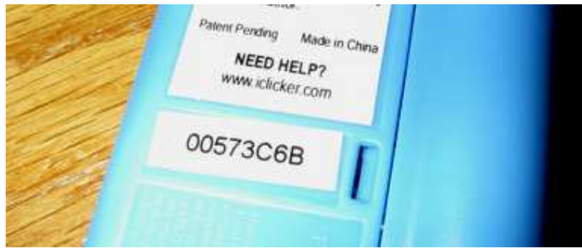
Figure 1: Location of Label on iClickers