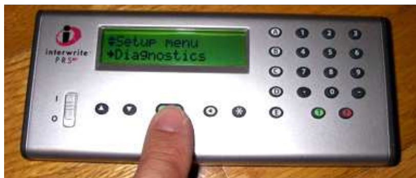
Figure 5: Interwrite Step 4