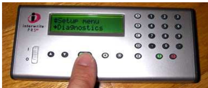
Figure 5: Interwrite Step 4