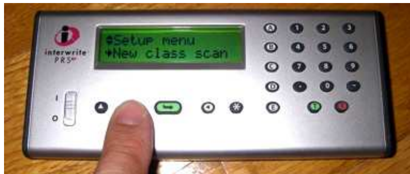
Figure 4: Interwrite Step 3